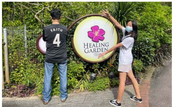
The locations are (1) Clock Tower, (2) Shaw Foundation Symphony Stage, (3) Evolution Garden and (4) Healing Garden at Neem Gate.

"From chasing after the animals to Daddy having to change t-shirts four times according to the sequence of the locations in route B made the day memorable for us.