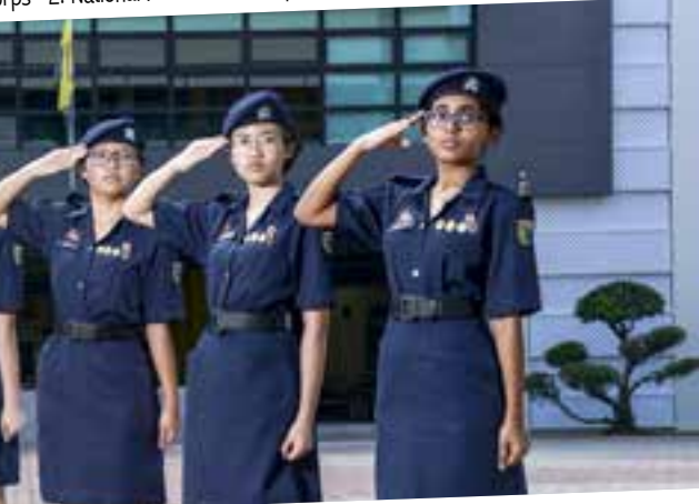
1.National Cadet Corps 2. National Police Cadet Corps 3. Girl Guides 4. Red Cross Youth